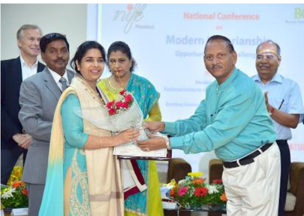
Best Librarian Award