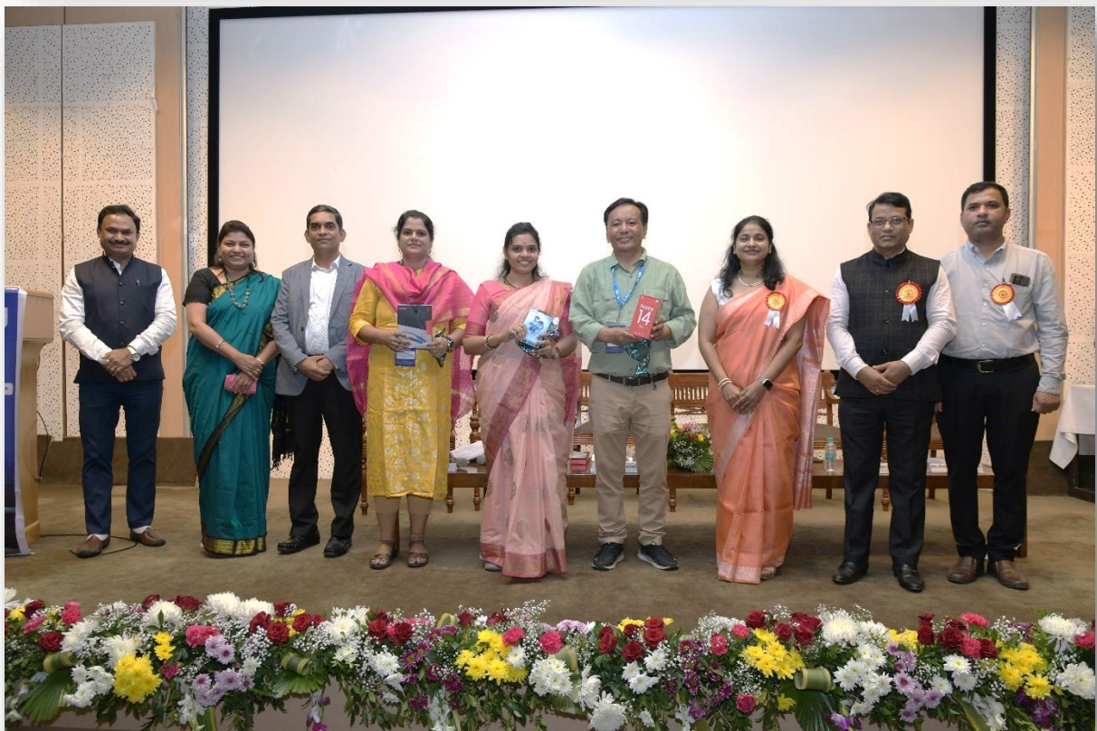
Winners of Lucky Draw